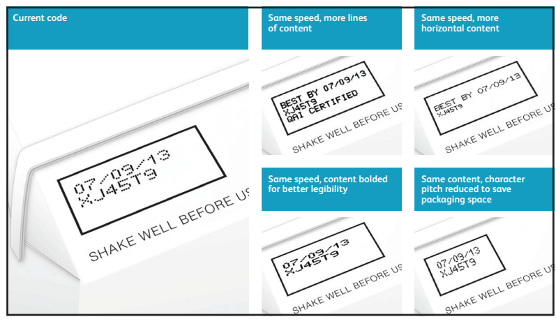
Printing options in varying content windows.

Videojet designs and tests its CIJ fluids in our fluid development center in North America. Ink formulations are manufactured in Videojet facilities in different regions of the world to ensure convenient supply chain availability to our customers. Ink production is managed in GMP compliant facilities to help ensure consistent production, batch after batch.